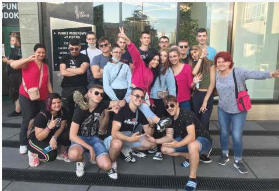
Mobility participants in Wrocław