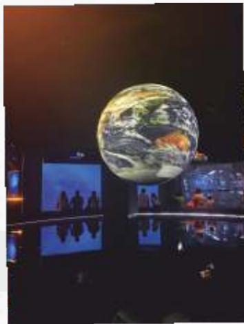
Visit to the Hydropolis museum