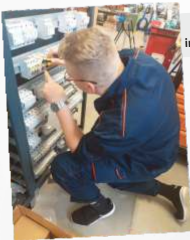
Professional practice in the field of industrial installations and automation in the company ZAE Sp. z o.o.